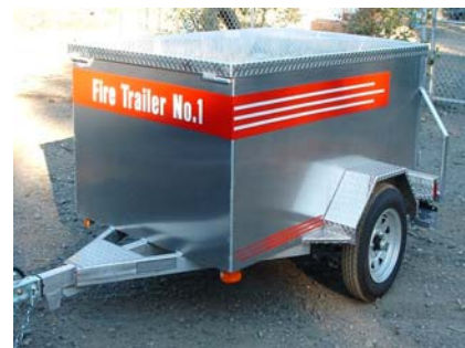
Fire Equipment Trailer